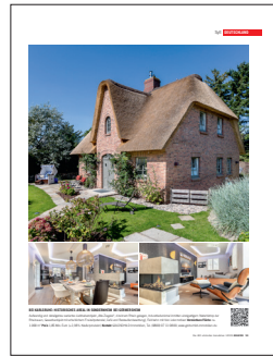
full page € 790