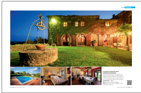
double page € 1.490

In addition, your property will also appear on www.bellevue.de .